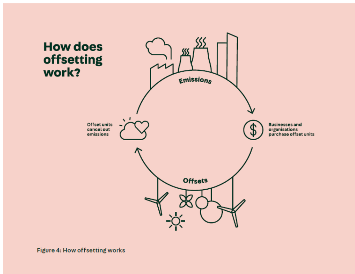
Figure 4: How offsetting works

The responsible entity for the event must adopt an upfront offsetting approach. The number of offsets cancelled must be equal to or greater than the pre-event carbon account. For large events, offsetting in advance must be followed by a true-up process after the event to ensure that sufficient eligible offset units have been cancelled to cover the event (further details at Section 3.4.1).