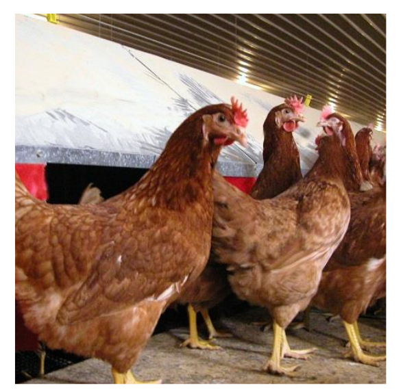
Barn Raised - aviary system/multi-tier 1.0 sq. ft./bird