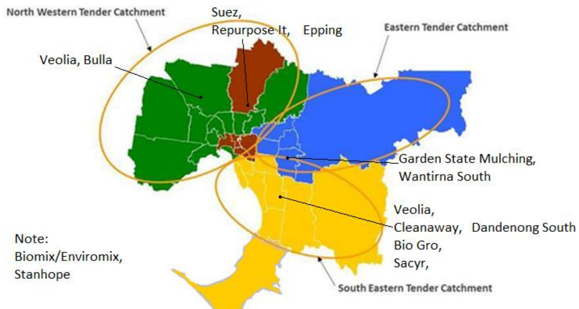
Figure 2 - Melbourne metropolitan councils currently in a MWRRG facilitated, joint tendered organics processing group and organics processor locations

note: brown shading covers the Additional Councils, as well as Boroondara and Stonnington Councils