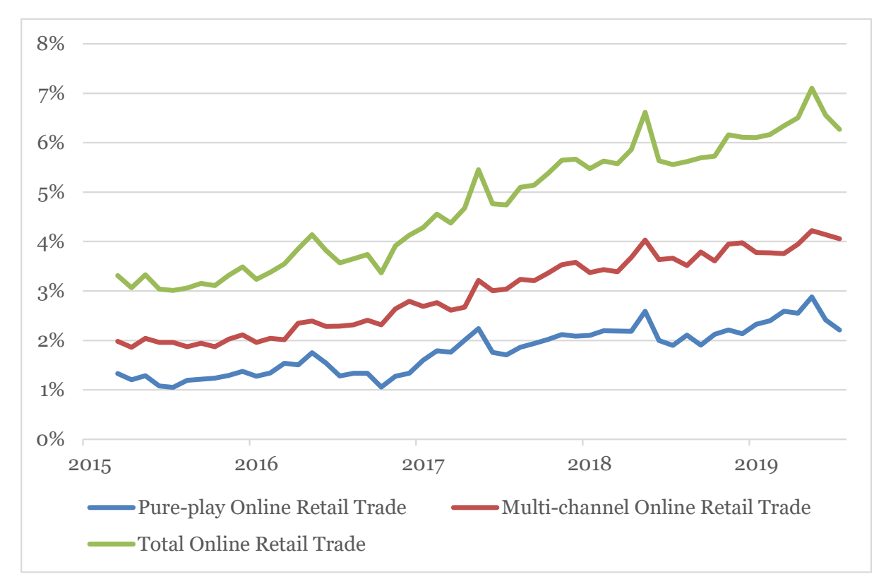
Figure 9-2: On-line retail sales as a percentage of total retail sales in Australia