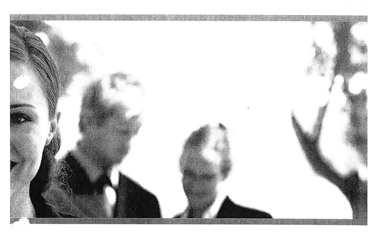
Compliance and enforcement policy