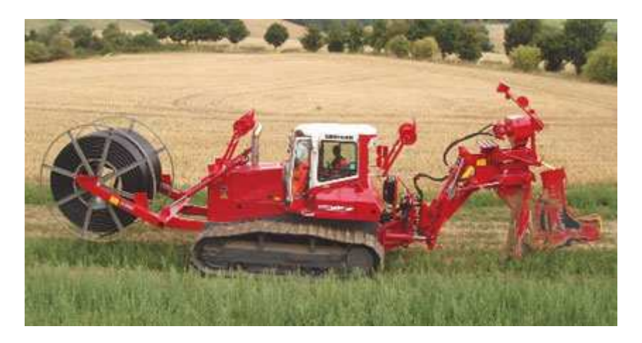
Figure 3 - Example Cable Plough<sup>8</sup>