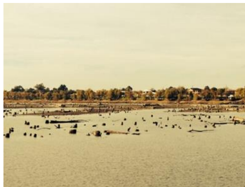
Lake Mulwala, Yarrowonga, Vic