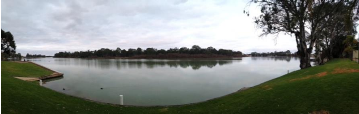
A view of the Murray River in Renmark, SA

The ACCC's Draft Advice is targeted at promoting efficient and sustainable use of water infrastructure, facilitating effective water markets and improving transparency of charging arrangements, while addressing the need to reduce the burden on the sector.