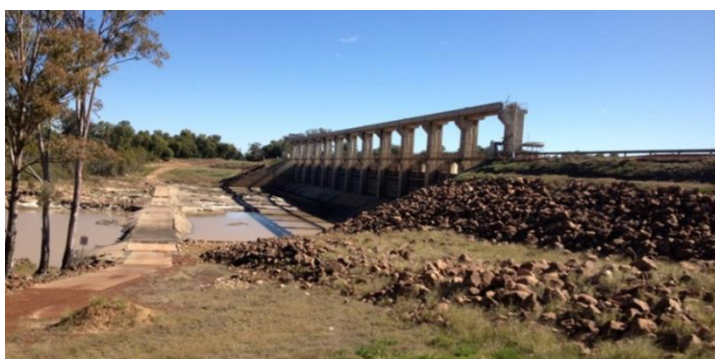
Weir at St George, Qld