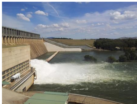
Hume Dam, NSW

Just like irrigators, these other water users require infrastructure services for the storage and delivery of water access rights that they hold. Typically, they will incur the same types of charges as irrigators where they use the same infrastructure services.