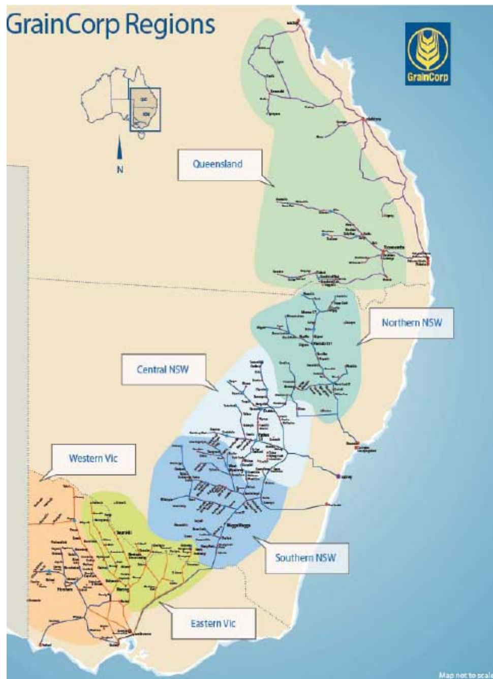
Figure 1.1.2: Map of GrainCorp's country receival site network