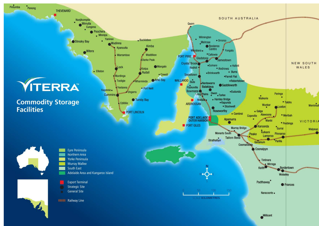
Figure 2 sets out Viterra's storage, handling and port elevator network in South Australia and Victoria.